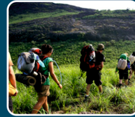
Natural Hills & Trekking