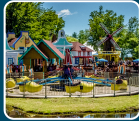
Desi Theme Park