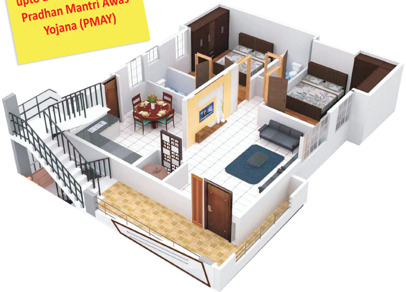
Floorplan for East Facing Plot (Without Carpark)

Avail Interest subsidy upto 2.64* Lakhs under Pradhan Mantri Awas- Yojana (PMAY)